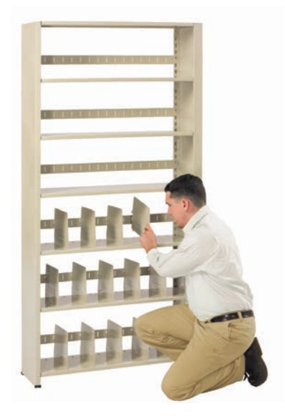
3. Add back stops or center stops, then place dividers.