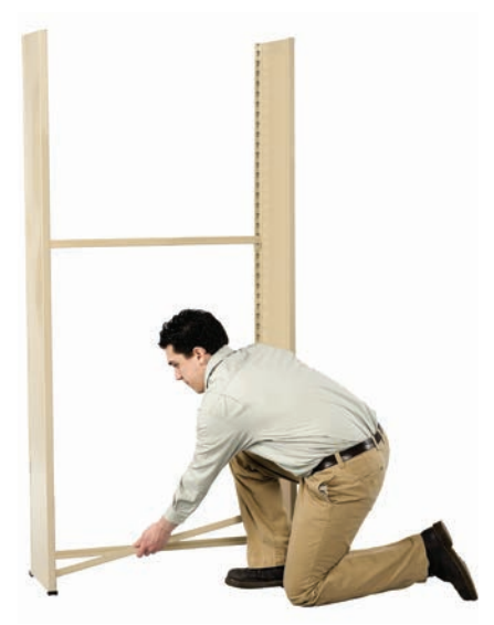
Place uprights opposite of each other and insert shelf supports. Use a rubber mallet to secure shelf supports.