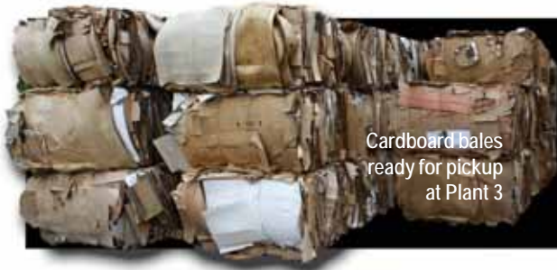
Cardboard bales ready for pickup at Plant 3

A FOREST SAVED ■ Does the air feel a little fresher? Last year Tennsco recycled 114 tons of paper (mixed, office and cardboard). For each ton of paper recycled, approximately 17 trees were saved.