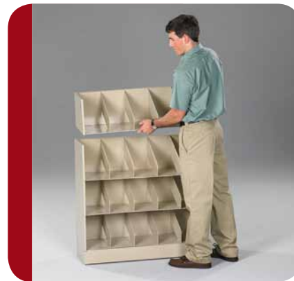
Choose your tiers,