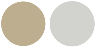
Sand (214) Light Grey (53)

Finishes shown above are representative of the actual finishes. Please contact your local Tennsco dealer for more precise color swatches.