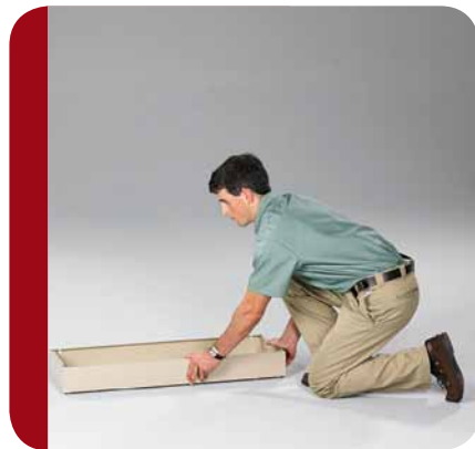
Start by selecting a base,