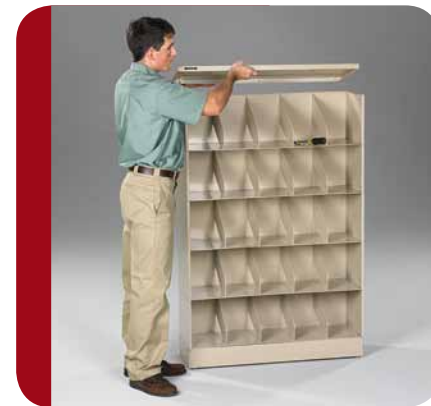
and begin stacking.